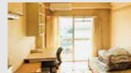
International House Single Room

© Total Average Monthly Living Expenses 80,000yen -