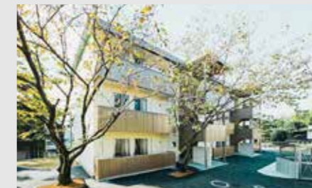
International House Bldg. C

Various levels of Japanese language classes are offered so that international students can choose one that matches their Japanese proficiency. The university also offers Japanese history and culture programs and field trips.